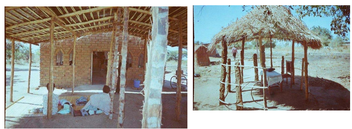
Ministers' Waiting Room above right:

Left: Brother Harold Beckett Ministering. Note: No window panes, doors or ceilings in the building and Believers are sitting on solid concrete block seating,