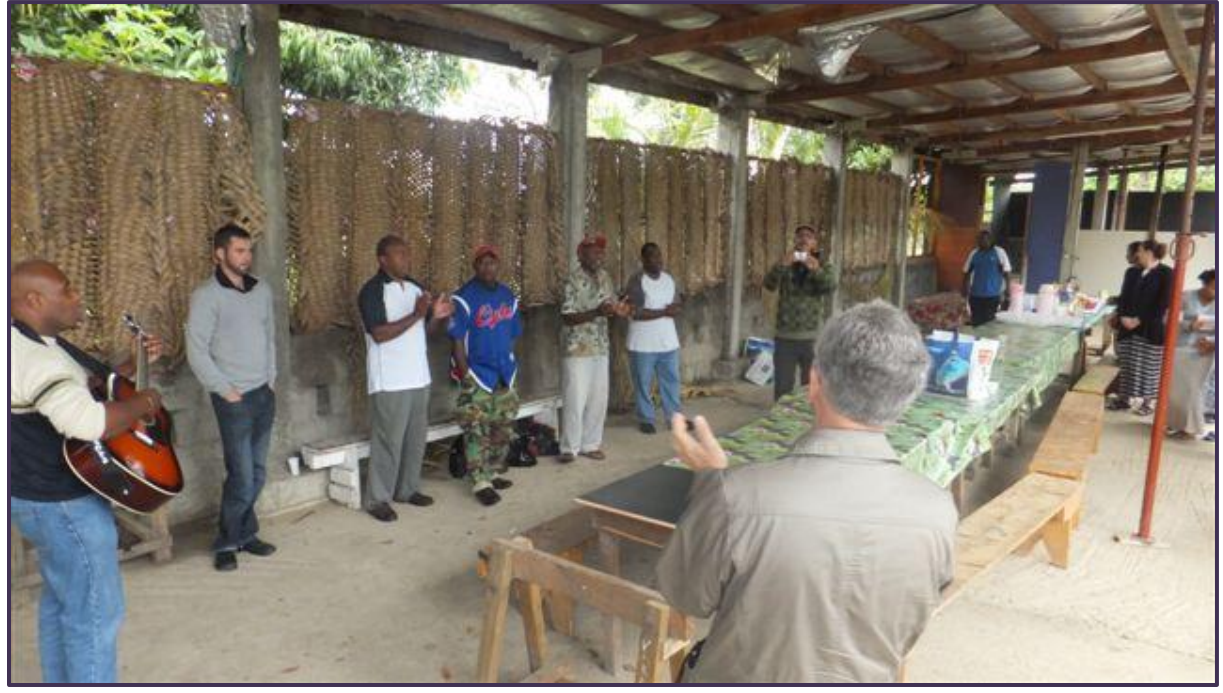
Gathering to have a meal at a denominational Church on the outskirts of Noumea as Vanuatu Brethren just arrived and some New Zealand and Australian contingent present also.

The purpose of the convention was to create a neutral ground where we could invite local ministers and others to come to the meetings and hear the message of the hour preached and taught in the fullness of the end time revelation.