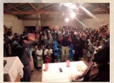
Night Meeting; Vanduzi Church Mozambique