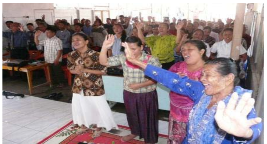
MEDAN: The presence of the Lord came down during the meetings in Belawan as the believers feed on the Word.